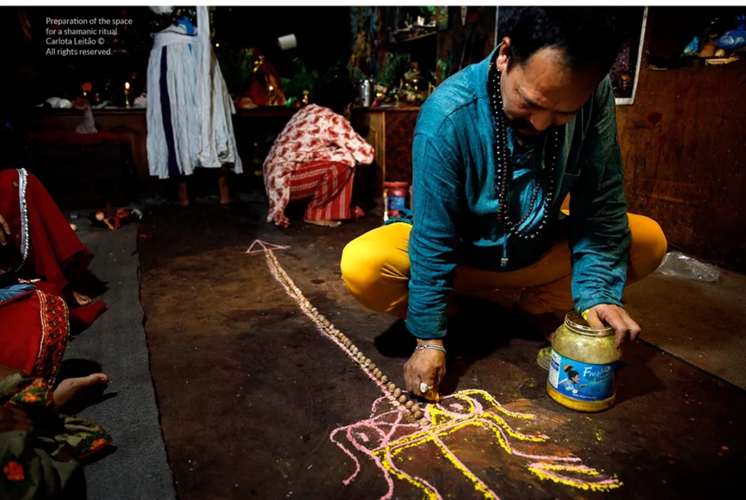
Preparation of the space for a shamanic ritual.