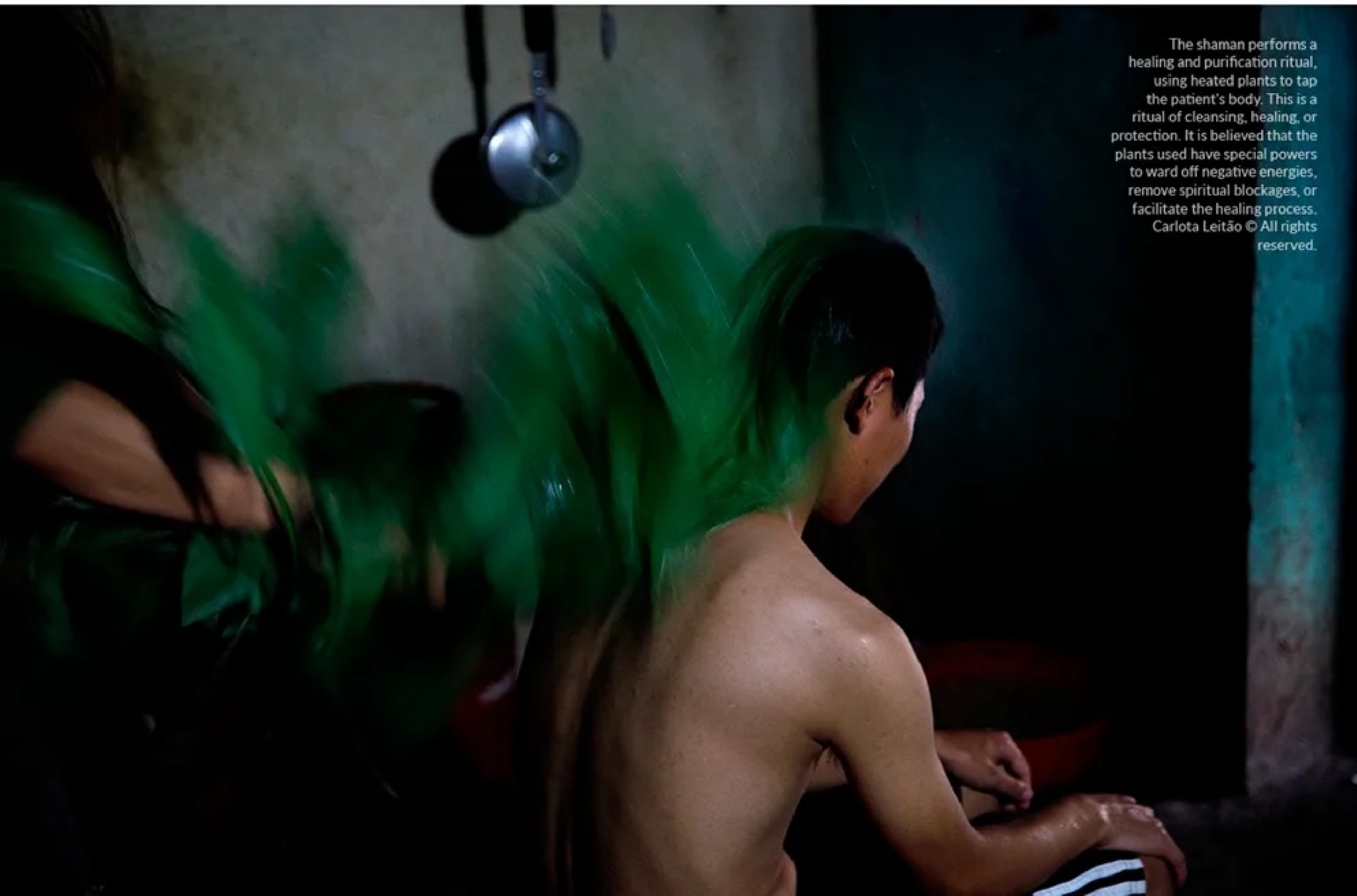
The shaman performs a healing and purification ritual, using heated plants to tap the patient's body. This is a ritual of cleansing, healing, or protection. It is believed that the plants used have special powers to ward off negative energies, remove spiritual blockages, or facilitate the healing process.