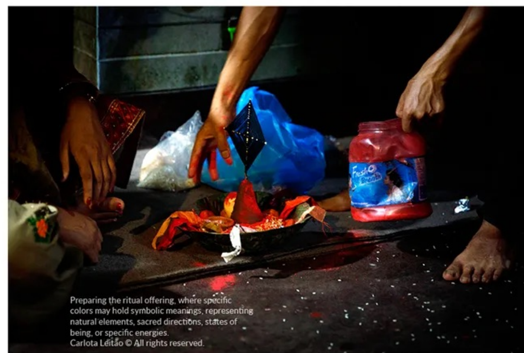
Preparing the ritual offering, where specific colors may hold symbolic meanings, representing natural elements, sacred directions, states of being, or specific energies.