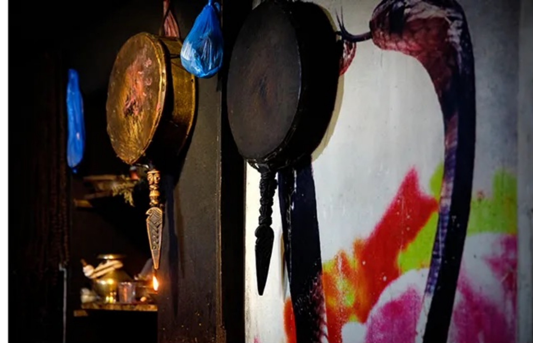
The environment where the ritual takes place.