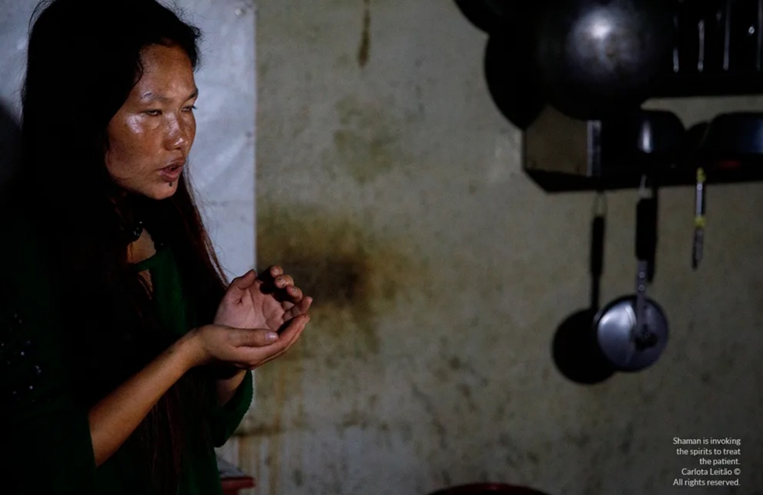
Shaman is invoking the spirits to treat the patient.